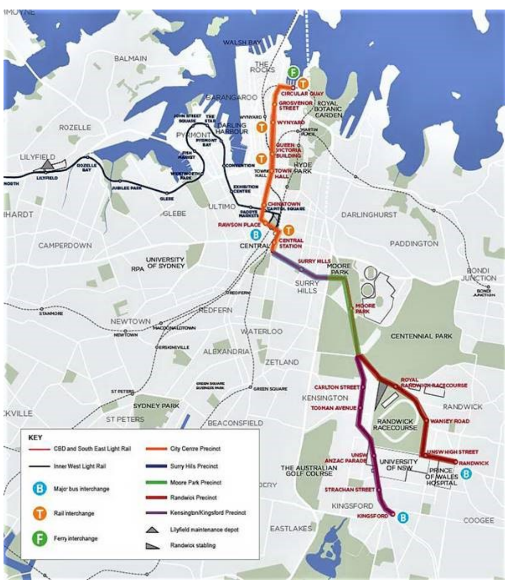
Figure 1 Map of the CBD and South East Light Rail precincts

Submission 39, Transport for NSW, Appendix 6.2, p 41.